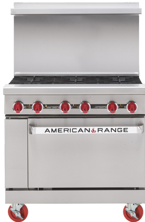
Model Shown ARGF-6